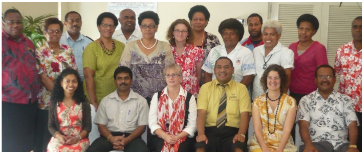
UTS researchers and workshop participants in Fiji